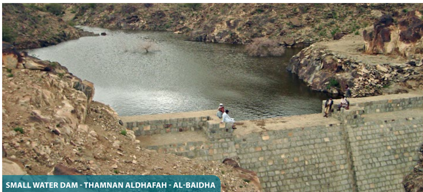
SMALL WATER DAM - THAMNAN ALDHAFAH - AL-BAIDHA

Implementation of projects began on 2 February 2013, with clearing the blockages in the sewerage networks of Zinjibar, Ja'ar and Al-Koad towns. During this quarter, one project was approved in the water sector worth $64,215 to serve 583 beneficiaries.