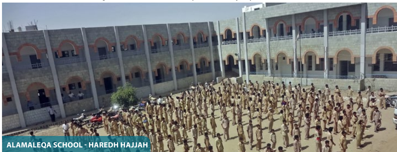
ALAMALEQA SCHOOL - HAREDH HAJJAH

A two-day consultation workshop was held in June 2013 on the development of the Ministry of Education's (MoE's) quality-education vision, policy and standards, in which all donors and MoE's various sectors. Also, training was provided to 37 participants from the MoE's Quality Education and School Accreditation General Directorate, education officers and Save the Children on children involvement in education quality vision.