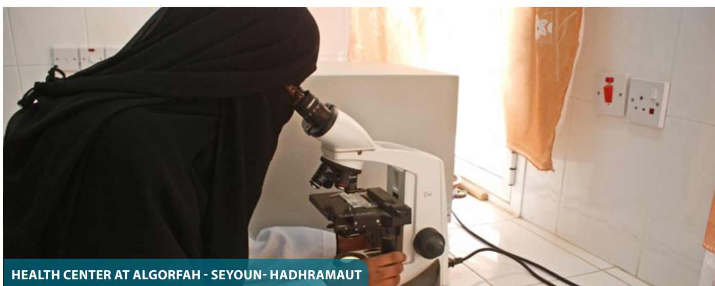
HEALTH CENTER AT ALGORFAH - SEYOUN- HADHRAMAUT

Reducing maternal and newborn mortality: This component is designed to expand and improve reproductive healthcare services by building and equipping basic and comprehensive EmOCs and maternal and child centers as well as equipping premature and newborn sections. During the quarter, the supply of medical equipment and furniture for the Motherhood and Childhood and basic EmOCs Section as well as needs assessment have been carried out and/or completed for certain hospitals and Maternal and Child Health Centers in Ibb, Sana'a, Hajjah, Amran, Al-Hudaidah, Taiz, Dhamar, Hadhramaut, Shabwah and Lahj Governorates. Also, 6 projects have been developed/implemented to qualify technician and community midwives in Amran and Taiz as well as to qualify female students from Hadhramaut, Hajjah, Ibb and Amran in community midwifery.