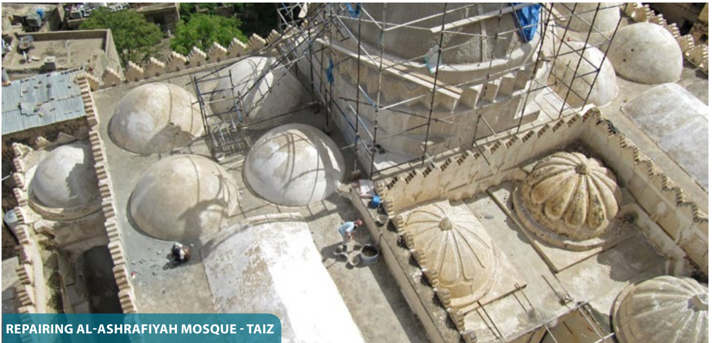
REPAIRING AL-ASHRAFIYAH MOSQUE - TAIZ

Work continues on the project in a good rhythm. During the current quarter, restoration works continue in the walls of the eastern corridor as well as the eastern frontispiece and the gate's outer side of the mosque; in addition to the cracked inner and outer southern walls.