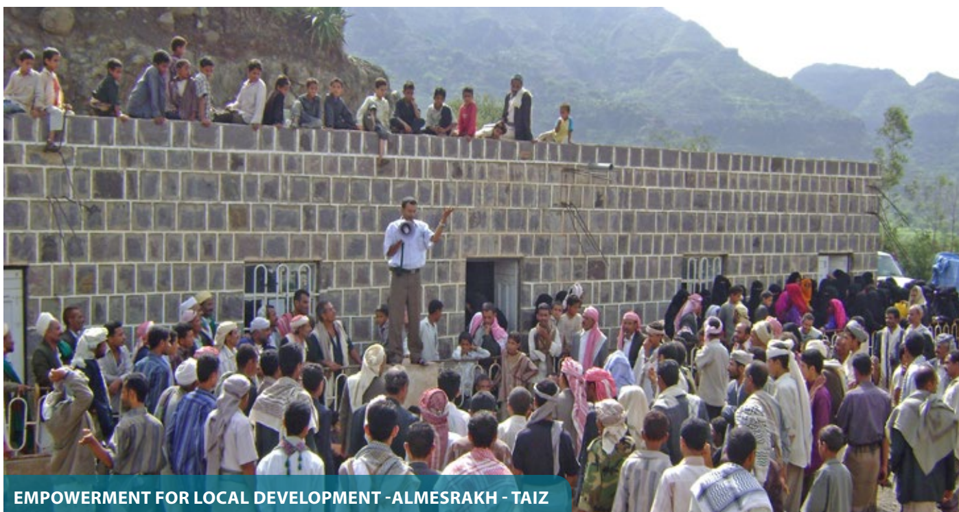
EMPOWERMENT FOR LOCAL DEVELOPMENT -ALMESRAKH - TAIZ

Various activities were implemented by SFD BOs in Hadhramaut, Al-Hudaidah, Hajjah, Aden and Sana'a. These comprised of coiffeur training targeting 15 females from three Women associations in Al-Mukalla and Al-Shehr as well as training in basics of development work for 25 females from Al-Dhamir Charity Foundation in Ainat (Hadhramaut). This is besides the achievement of about 75% of civil works concerning the rehabilitation and furnishing of Yemen Women Federation (Al-Mukalla BO). Similarly, 38 persons were trained in capacity building, management skills and fund raising, of which four associations in Al-Hudaidah benefitted. Also, 18 persons were also trained in evaluating the organizational capacities of local associations. The training targeted 5 associations in Hajjah governorate and 10 females from two associations in Abyan governorate on sewing.