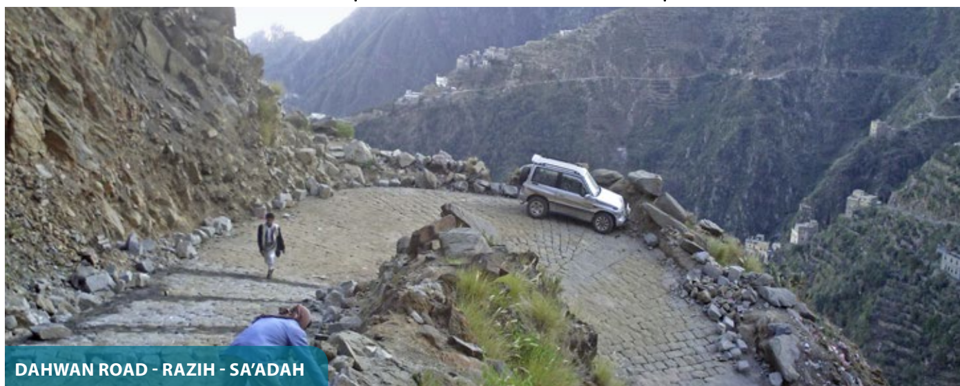
DAHWAN ROAD - RAZIH - SA'ADAH