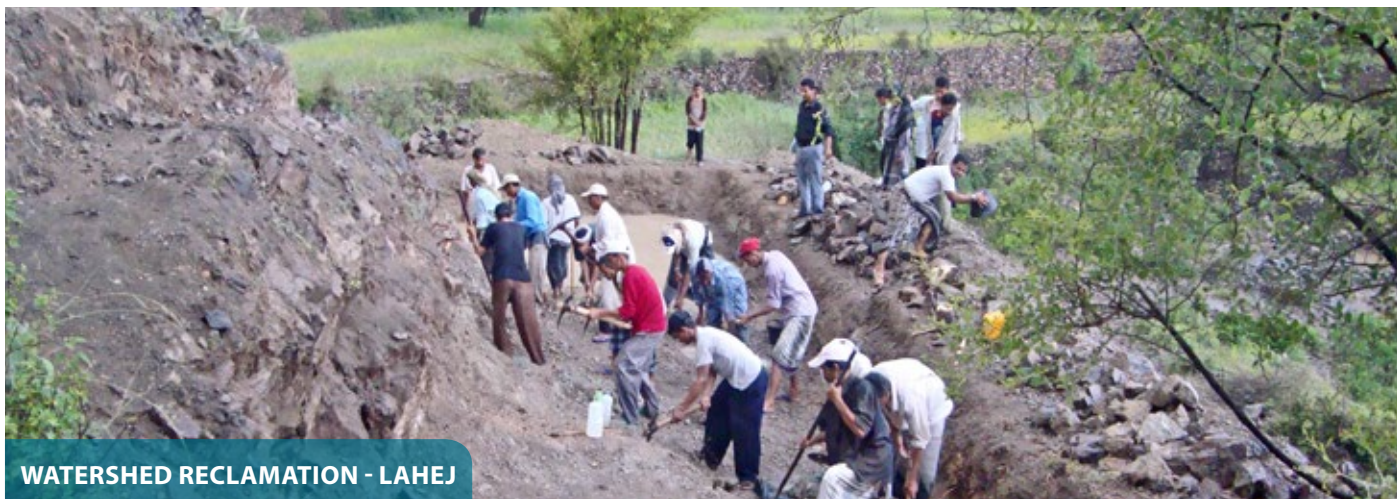
WATERSHED RECLAMATION - LAHEJ

In community mobilization , the quarter witnessed the launch of activities aiming to organize and strengthen the role of the community through the formation of community-based structures that will manage the program's various activities (projects, parents' councils, and groups carrying out agricultural and economic activities).